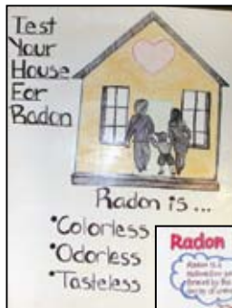
2nd Place -Raquel